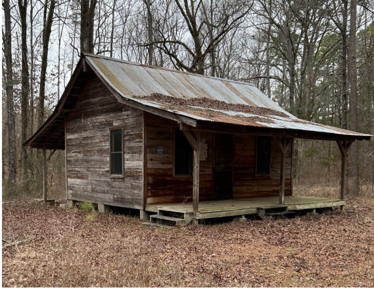
Cabin Remodel Before