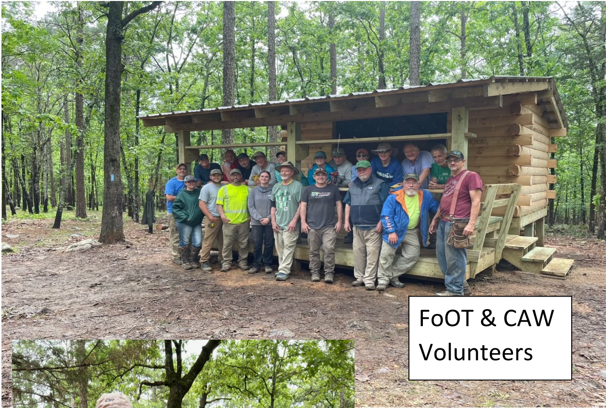
FoOT & CAW Volunteers